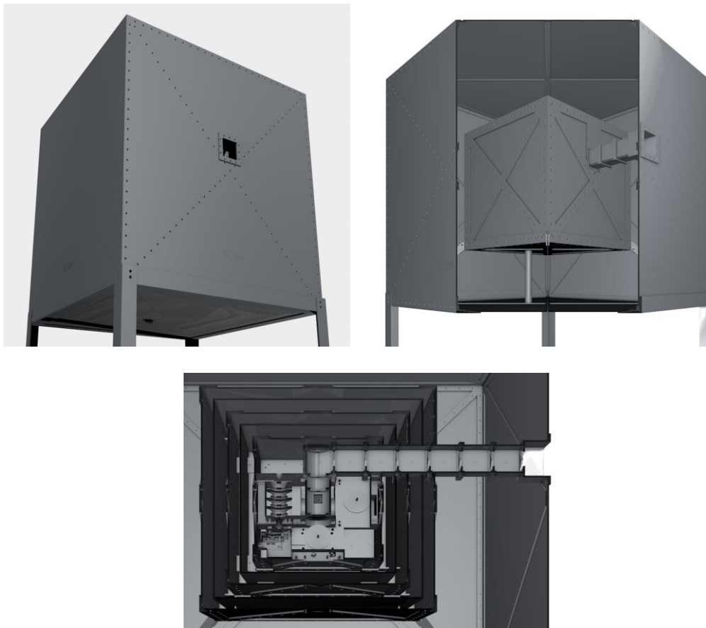
Figure 2: Some images of the “machine”; 1) external view, 2) internal view sectioned from at an angle, 3) vertical section corresponding to the central zone.

What we have outlined above, to the purely rational mind, cannot appear to be anything but the “usual pseudoscientific fantasy”. But here, for the incredulous and others, a new fact intervenes: thanks to that “fantastic theory” it has been possible to construct a machine and, by means of which, experience it. Thus the “Theory” becomes “Theory validated by experimentation” and, for our “scientific” method of procedure, this is more than sufficient to say that the theory is correct and that “life” behaves according to its directions.